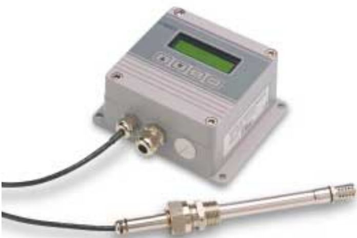
Vaisala's microprocessor-based HMP228 transmitter enables continuous moisture and temperature measurements in transformer oil.

The presence of moisture in liquid transformer insulation plays a critical role in the life of a transformer.