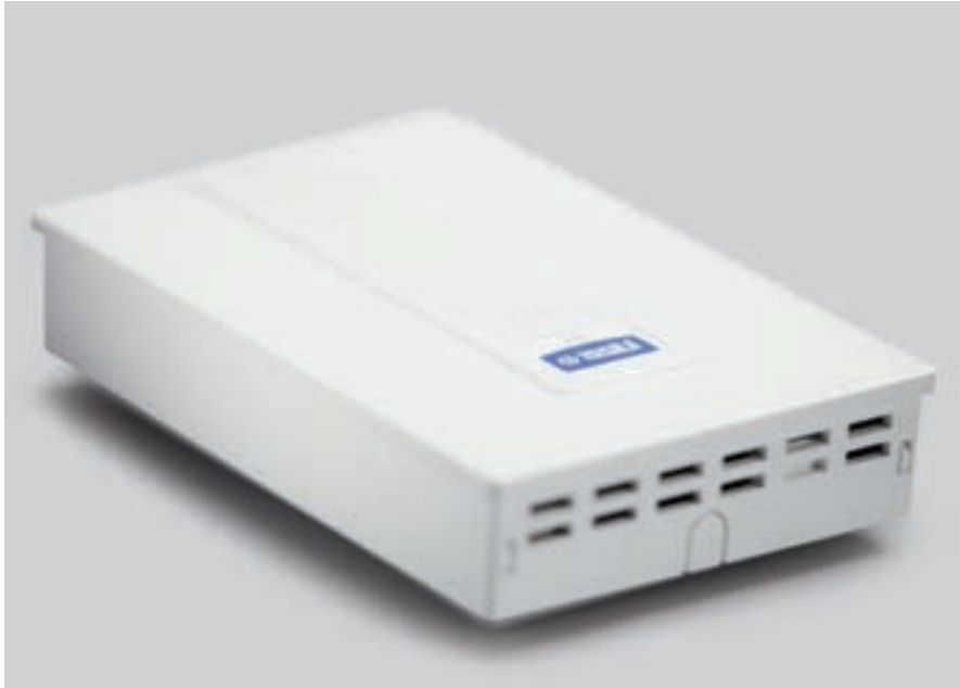
The Vaisala CARBOCAP® Carbon Dioxide Transmitter GMW115 is a wall-mounted CO 2 transmitter for demand-controlled ventilation.